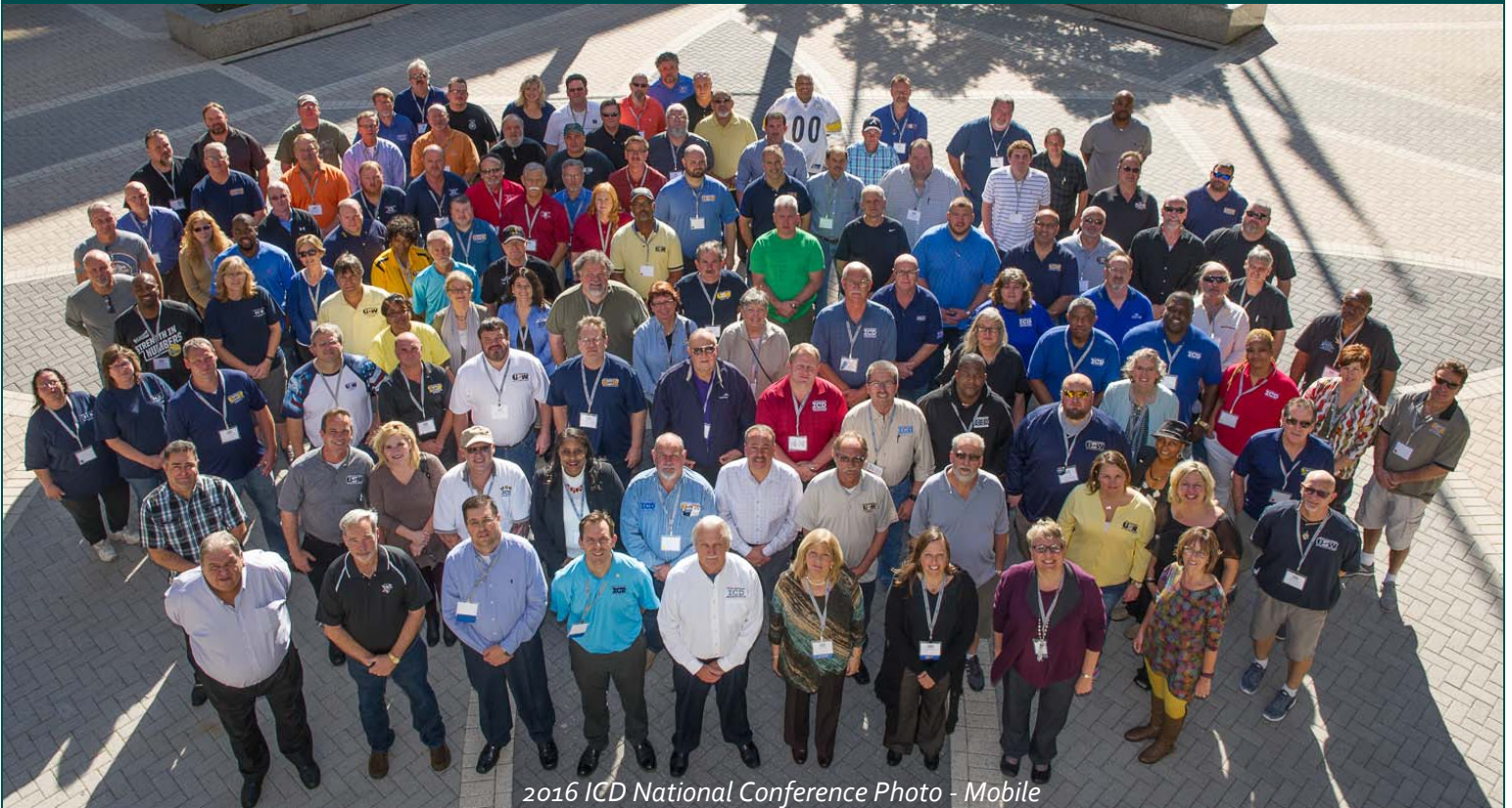
2016 ICD National Conference Photo - Mobile