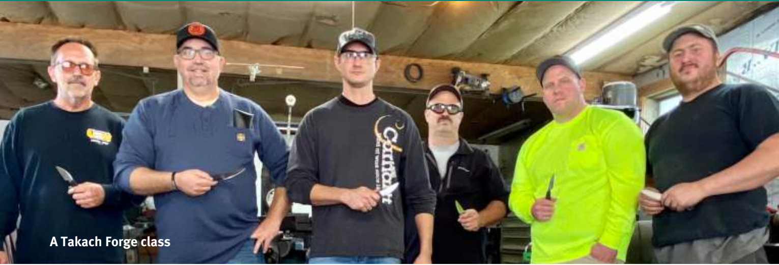
A Takach Forge class